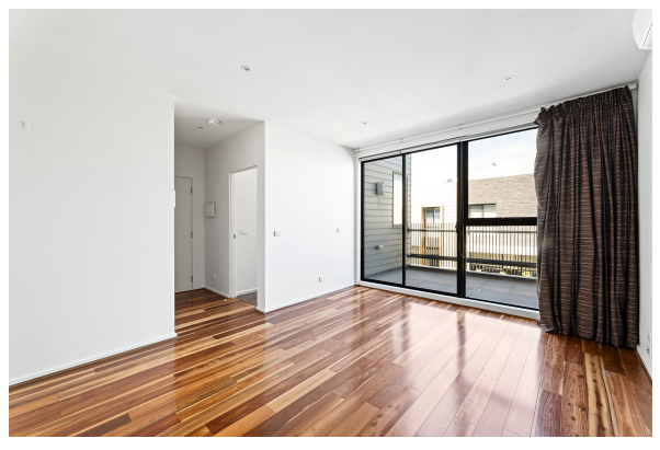
3/3 Barries Place, Clifton Hill VIC 3068